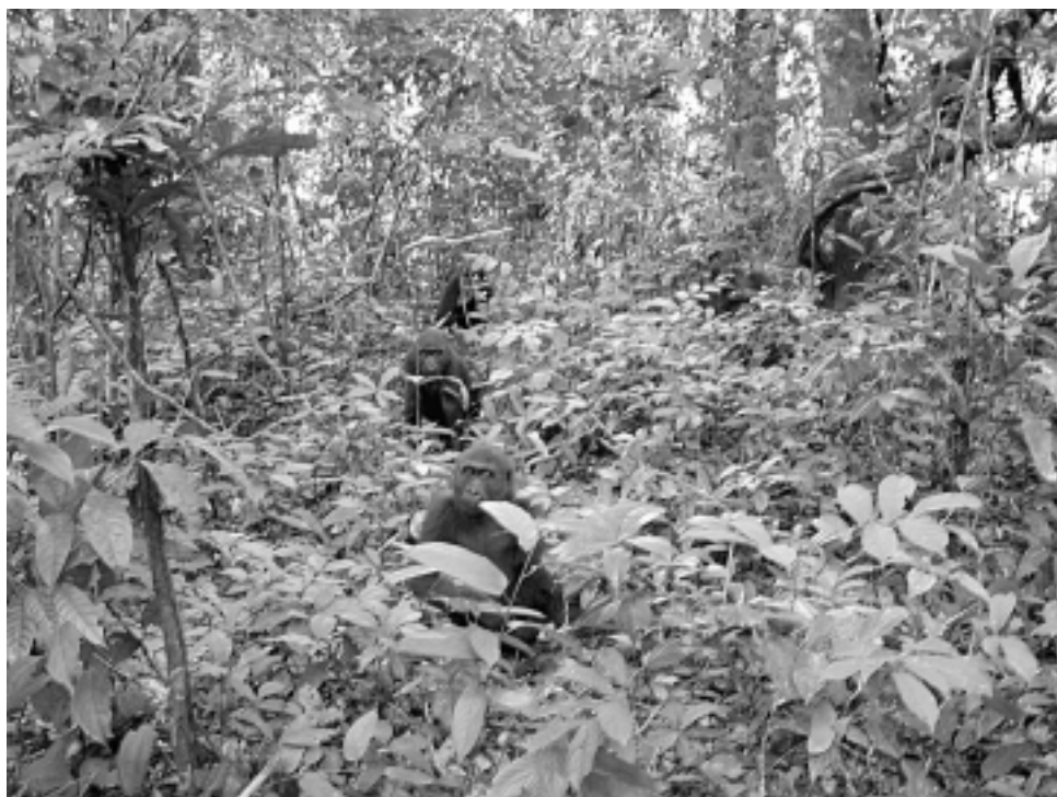
Figure 3—Gabon has perhaps the largest population in the world of western lowland gorillas.

A more recent study published in Science (Balmford et al. 2002) titled "Economic Reasons for Conserving Wild Nature" and launched at the WSSD, sought to remedy these issues in the 1997 study. The new effort compared the benefits of protection versus the benefits of conversion as directly as possible, selecting for analysis five development projects where data were available both on the revenues generated by conversion as well as the value of the ecosystem goods and services provided by the intact habitat. The data included values for marketed and