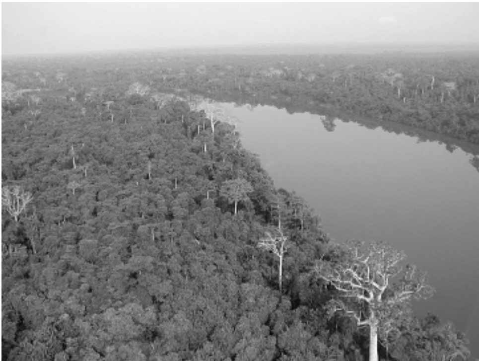
Figure 2—Waterway and dense tropical rain forest of Gabon.

Collectively they provide critical information about the world's remaining wild area.