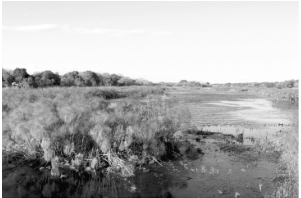
Figure 1—Futi Channel, a wetland area linking southern Mozambique and South Africa.

Wilderness conservation is also making strides in southern Africa, in particular with transboundary protected areas. Since the 1997 creation of the first official transfrontier park in Africa, the Kgalagadi Transfrontier Park between Botswana and South Africa, several major transboundary projects have gained momentum. Among them is the Great Limpopo Transfrontier Park, officially created in 2002. This 3.5-million-ha (8.6-mil-